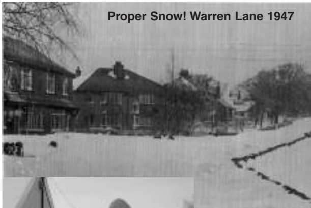
Proper Snow! Warren Lane 1947

Issue No 362 January 2009 The Eldwick Village Society Newsletter. Email: Eldwicknews@aol.com